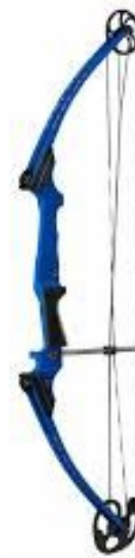
Genesis bow: (picture above) The Original Genesis bow is nationally used in the NASP program (National Archery in the School Program)

Those are just a few of the rules of archery. There are also many other rules and common sense. Each student started out with three arrows in the beginning then slowly moved up to five. During archery, the main two places to shoot from are 10 yards and 15 yards. After both rounds shoot 3-5 arrows, everyone heads to the targets. The proper way to remove the arrow from the target is to stand on the right side of the target, place one hand flat on the target next to the arrow, and with the other hand, pull the arrow out and drop it onto the floor. After each arrow is removed and on the ground, pick up the bundle of arrows and level them on the top of the target. Each student takes their bundle of arrows and places it back in the quiver. In the beginning of the archery season, many students could barely make it on the target. Now, after archery is over, many students can make multiple bullseyes at 10 and 15 yards. Mr Palumbo has been an amazing teacher from whom the students have learned a lot. Many hope to return to archery next year. Mr. Harden, Mr. Bennett, Mr. Baker, and Mrs. Palumbo were also amazing teachers/helpers.